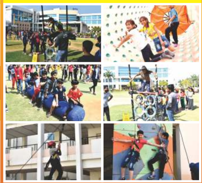
Adventure feats of B.P.S. Students with adventure Camp held at the school campus.