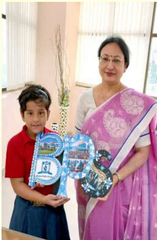
Photo Frame Competition was organized for class III. The students exhibited their creative skills, using various things & made photo frames in their own amazing ways. The activity was full of passion and spirit.